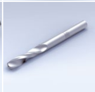
Leitz full range of products