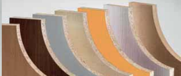
Diamaster PLUS 3 and PRO 3

Real-Z3: Higher productivity and a better cut quality