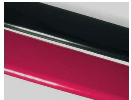
Finish with Leitz Duo-Multi-Profile scraper

Leitz GmbH & Co. KG Leitzstraße 2 73447 Oberkochen, Germany Tel. +49 (0) 7364/950-0 Fax +49 (0) 7364/950-662 leitz@leitz.org www.leitz.org