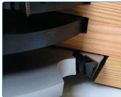
Wooden window frames Slot- and tenon joints, counter profiles