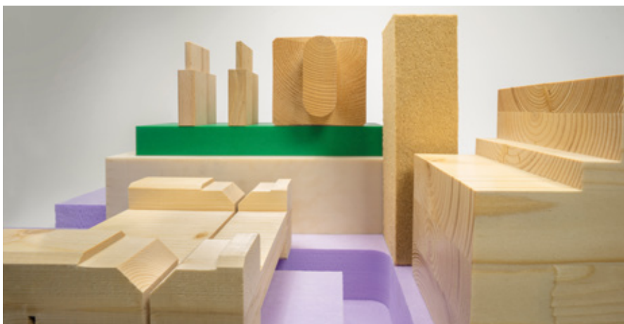
The HeliCut-System with tear-free machining results in different materials and various machining processes.